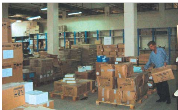
Main medical warehouse in Basra, Iraq, after delivery of a major humanitarian aid shipment in 2003. The technical complexity of medical logistics means it requires careful and detailed consideration