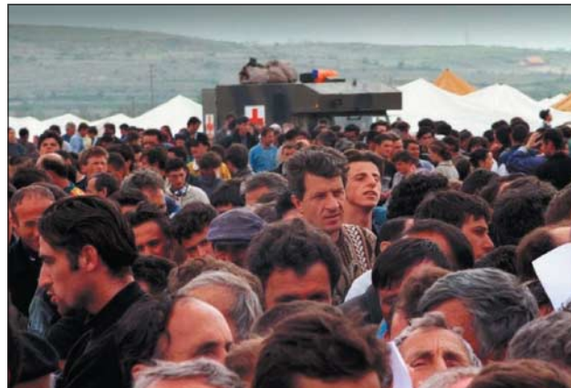
British Army ambulance in a refugee camp in Kosovo, 1999. Military medical forces may be the only medical services available in the immediate aftermath of conflict

Environment —The geography of the area of operation is reviewed, and factors such as distance, environmental temperature, roads, airfields, and other geographical features are considered. The locations of indigenous medical facilities and structures such as water treatment facilities, power stations, food storage sites, etc, must be noted.