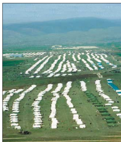
The final military medical plan must be aligned to the overall humanitarian plan for the affected region