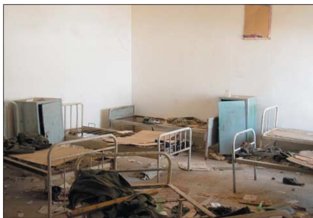
A looted hospital ward in Iraq in 2003, showing the need for adequate protection of medical forces