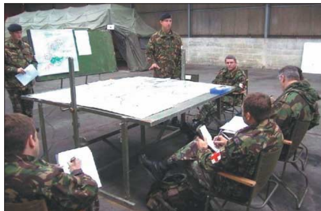
Written instructions and verbal briefings may be needed as the medical planner assigns each of the component parts of the military medical response to subordinate leaders

Graphical tools such as marked maps or project planning timetables may help to convey specific details. Planning conferences and workshops, such as tabletop exercises used in emergency planning, may also help mutual understanding between organisations.