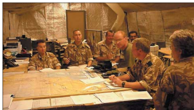
Senior military medical planners and commanders discussing medical arrangements to support military exercise SAIF SERREA in Oman, 2001

To provide humanitarian assistance in the south west of Rwanda in order to encourage the refugee population to stay in that part of the country