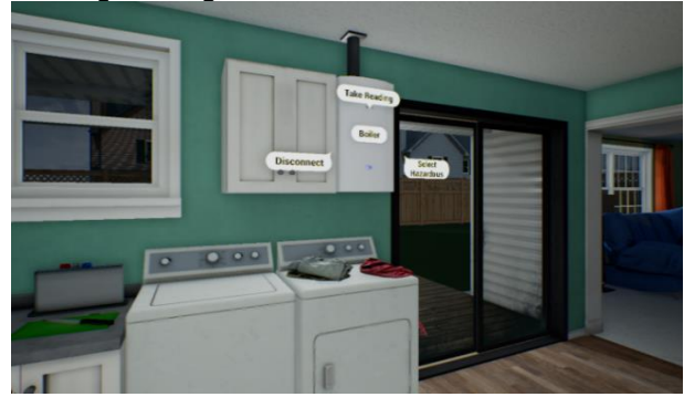
Figure 2. Second Scenario with Potential Solutions

operatives and be an excellent addition to their existing training courses.