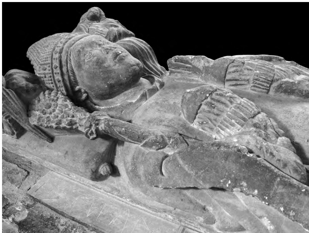
Fig. 2. Detail of the head of the effigy on John Marshall's tomb in Llandaff Cathedral.

Measurement suggests it would indeed have fitted within the alcove—possibly rather better than the 'Bromfield' effigy. But the alcove is some way away from the altar steps, and Marshall is carved looking at something immediately above his head.