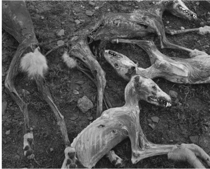
Fig. 7. Frederick Sommer, Coyotes, 1945, photograph

the history of photography. Through to the mid-1960s, Sommer's work stayed in the public eye only through his presence in Aperture , edited by Minor White, who published his work in 1956, 1961 and 1962. 46 Whenever it appeared, it stirred controversy. In the late sixties, however, his work began to be shown more widely, with major exhibitions in Washington (1965), Philadelphia (1968) and New York (1972). Even so, the weighty retrospective volume of a major photographer one would expect did not appear until 2005—six years after Sommer's death. 47