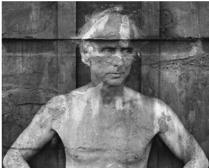
Fig. 4. Frederick Sommer, Max Ernst, 1945, photograph

Ernst’s experience of Arizona led him in 1946 to go with Dorothea Tanning to live in Sedona. Many friends, including Marcel Duchamp, Henri Cartier-Bresson and Man Ray visited them there, and it’s interesting to speculate which of these visitors the Sommers met. Certainly, as described below, they saw Yves Tanguy and