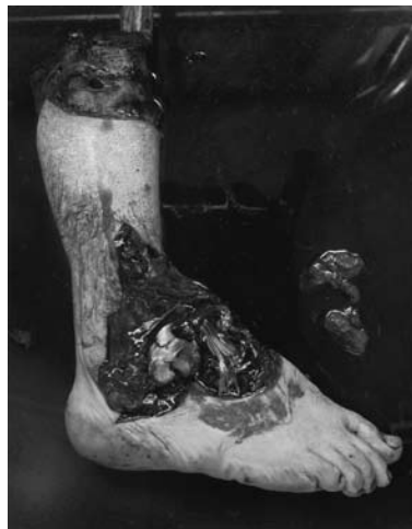
Fig. 10. Frederick Sommer, Untitled (Amputated Foot) , 1939, photograph © 2008 Frederick & Frances Sommer Foundation