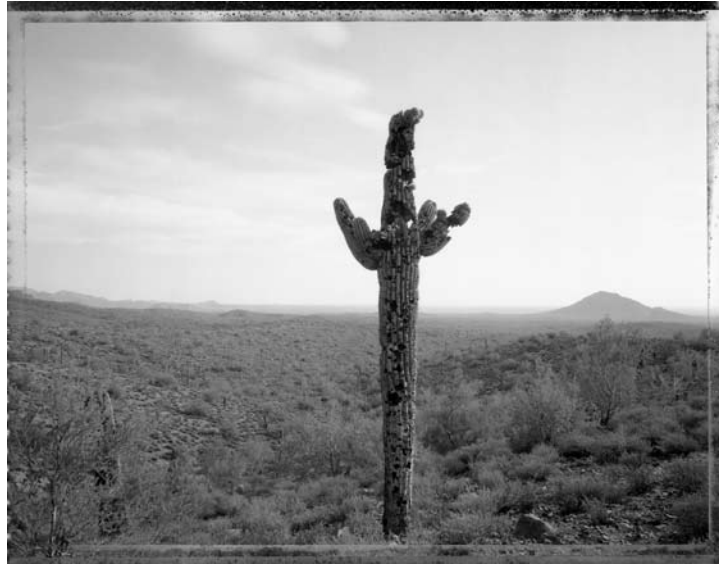
Fig. 8. Mark Klett, Bullet-riddled saguaro, near Fountain Hills, Arizona, 11/21/82 , photograph © 2008 Mark Klett

back onto Sommer's landscapes—he was after all making these images of death and survival while a World War raged elsewhere. 55 When Max Ernst made his paintings of jungles, forests and petrified cities in the 1930s, their commentary on the rise of fascism was deeply embedded but unmistakable; might we not read the Arizona Landscapes in a similar way?