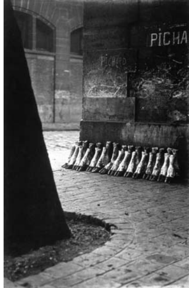
Fig. 9. Eli Lotar, Aux abattoirs de La Villette , 1929, photograph reproduced in Documents , 1:6 (November 1929), 327