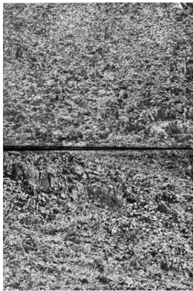
Fig. 3 Page spread from VVV , 4 (Feb 1944), 54-5.

Sommer’s Arizona Landscapes entered the discourse of Surrealism in 1944, when two were reproduced in VVV , the magazine of the surrealist exiles in New York (Fig. 3). 11 Edited by the young photographer David Hare, its editorial board comprised the formidable triumvirate of André Breton, Marcel Duchamp and Max Ernst. The landscapes selected were those with the greatest intensity of all-over small detail, and the effect of mental irritation and claustrophobia in those chosen