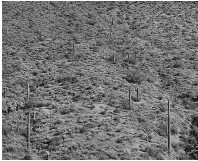
Fig. 2. Frederick Sommer, Arizona Landscape , 1945, photograph © 2008 Frederick & Frances Sommer Foundation

Within this overall effect, however, are various ways in which these images work. I have seen some eleven different photographs in several publications entitled Arizona Landscape , made between 1941 and 1947, though 1943 is their moment of greatest concentration. 6 They vary in the distance the camera is set up from the landscape, in the sense of rhythm and flow that move through the pictures, and in the varying relationship of rocks, scrub and cacti within them (Fig. 2).