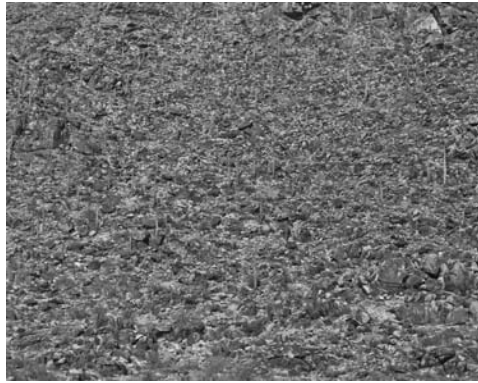
Fig. 1. Frederick Sommer, Arizona Landscape , 1943, photograph © 2008 Frederick & Frances Sommer Foundation

Arizona Landscape is the factual, neutral title given by Frederick Sommer to a series of photographs he made in the early 1940s (Fig. 1). Exploiting the clinical, dispassionate eye of the large format plate camera, Sommer selects and frames sections of the desert, an expanse of nondescript rocks and scrub, irregularly punctuated by vertical strokes of cacti. The surface of the land rises to the surface of the photograph and eliminates the sky. Though the pictures' textures are crisp and hard, the overall tone is a mid-grey and no single form dominates any other. The eye