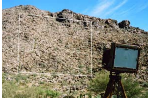
Fig. 11. Ian Walker, At Rich Hill, Arizona, with Frederick Sommer's camera, showing the terrain depicted in 'Arizona Landscape, 1943,' photograph © 2008 Ian Walker

We pack up the 10 x 8 camera and bounce over the arroyos back to the main highway, cut south through Wickenburg and the fake green lawns of Sun City, around Phoenix to Tempe, where Jeremy drops me off at the university. A couple of days later, I deliver my paper and the day after that, I’m flying back to London. 77